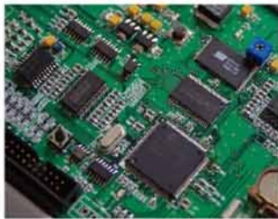
High speed CPU control circuit