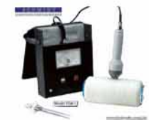
Textile Moisture Meter