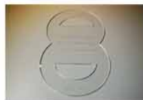
Neck stretch gauge