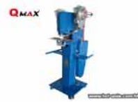
Button Attaching Machine