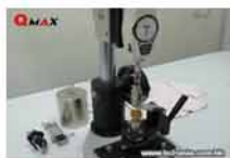
Button Pull Tester