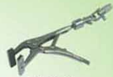
STA-0007N 專用拉鏈夾具 Special Zip Fixture