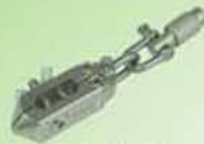
STA-0002 上部凸面五爪鉗鉗夾具 Upper Stud Grip