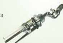
STA-0041B 上部四孔鉗/牛仔褲鈕三爪鉗夾具 Upper Three Pronged Grip