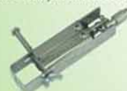
STA-0005 上部工字鉗鉗夾具 Upper Grasp Button Grip