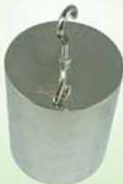
STA-004N 30N 標準砝碼 Standard Weights