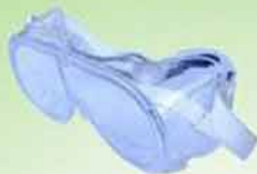
STA-0035 安全護眼罩 Safety Protective Eyewear