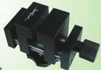
STA-0084 專用拉鏈鉗座 Vise Clamp For Zip