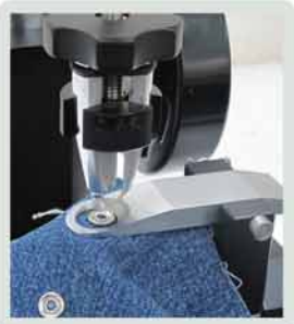
KAI-300N 指針式推拉力計 Analog Pull And Push Gauge