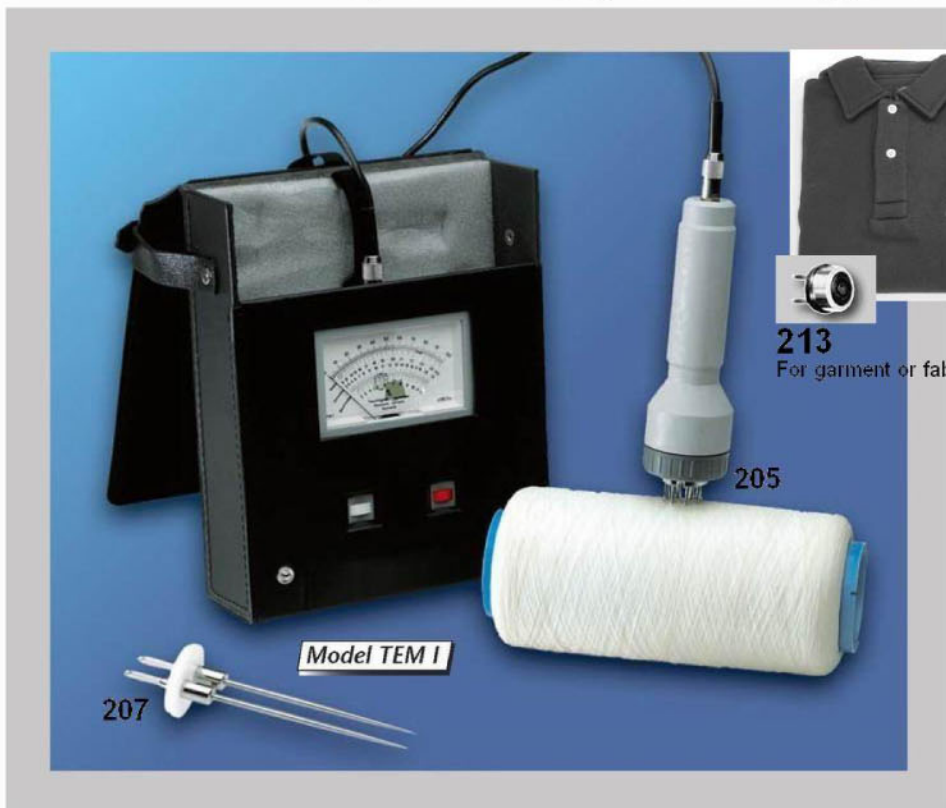
213 For garment or fabrics