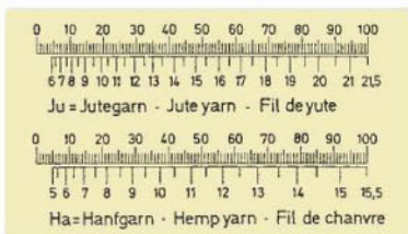
Comparison tables for 36 fiber types