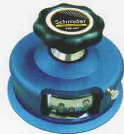
Model : GSM-100