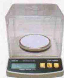
Model : GSM-200